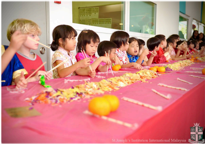
St. Joseph's Institution International Malaysia