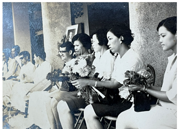
La Salle Nakhonsawan