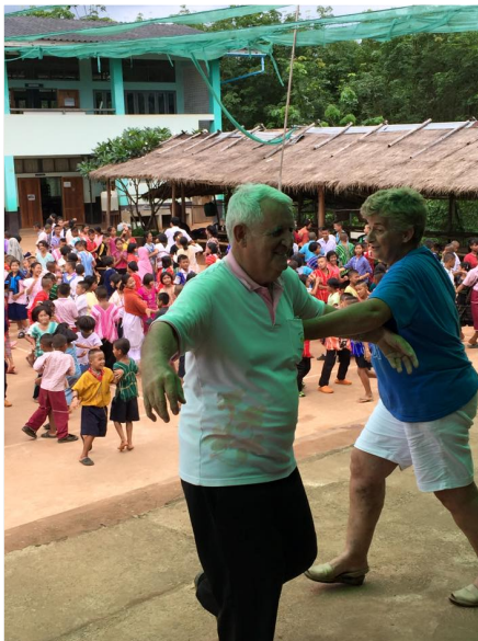
La Salle Learning Centre, Sangkhlaburi