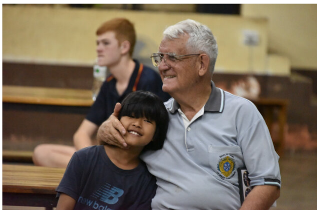
Blue Sky Home