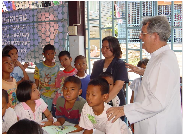
La Salle Nakhonsawan