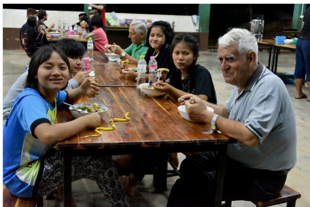
Blue Sky Home