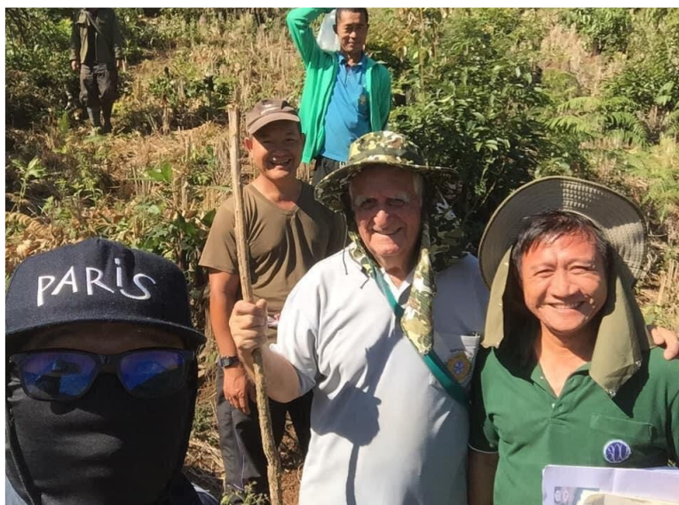
La Salle Mae Hong Son Ocular Visit