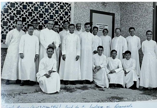
La Salle Bangkok